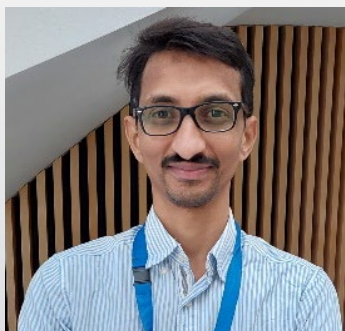
Dr. Nagaraj Patil, IMDEA Energy Institute Madrid – SP

Redox polymers are proposed as promising organic electrode materials for smart, scalable, safe, and sustainable electrochemical energy storage devices. They bring advantages in terms of cost-benefits, diversity, good processability, unique electrochemical properties, making them as versatile candidates for various energy storage devices. In this lecture, development of diverse redox polymers as electrode active-materials in different organic battery technologies, ranging from monovalent Li-ion-to-trivalent Al-ion, including all-polymer batteries will be covered.