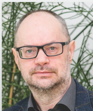
Prof. Miran Gaberšček, National Institute of Chemistry – SL

In the lecture, general importance of impedance spectroscopy and basic principles will first be presented. After discussing a qualitative analysis of the main features of impedance spectra, a couple of easy-to-perform quantitative calculations will be introduced to determine main materials parameters, such as conductivity, dielectric constant, exchange current density or diffusion coefficient. Finally, complications arising due to poor contacts in solid-solid interfaces or other defect structures will be presented and discussed.